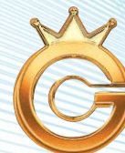
Awarded a gold medal of the world genius championships in Japan