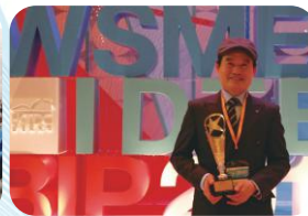
Awarded Grand Prix Award at 2015 International Inno Design Tech Expo