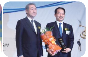
Chosen 3 year continuous korean global leader