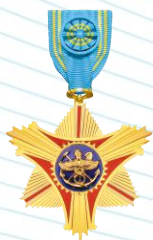
Order of Iron Tower Industry and invention