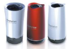
Forphyton Green Shower/ Air purifier