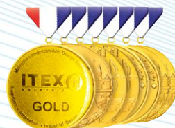
9gold medals in international inventions