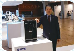
Exhibition at Musée du Louvre, Paris, France