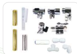
Alkaline Stick & Part